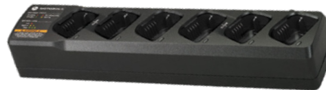
RM Multi-unit Charger Kit PMLN6384 $299.00