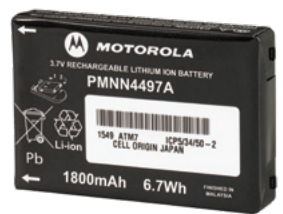
CLS Lithium Ion Rechargeable Battery PMNN4497 $35.00