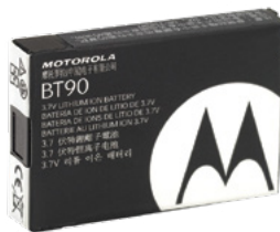
DLR & CLP High Capacity Li Ion Battery Kit HKNN4013 $40.00