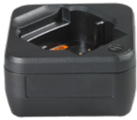
DLR Single Unit Charger Kit PMLN7140 $45.00