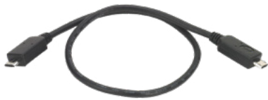
CLP Cloning Cable Kit HKKN4026A $20.00