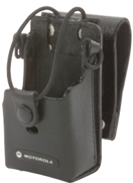
RDX & RM Leather Case w/ Swivel Belt Clip RLN6302 $55.00