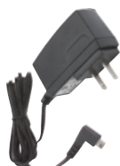
RDX Charger Adapter RPN4054 $22.00