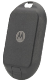
CLP Standard Li Ion Battery Door Kit HKLN4441 $10.00