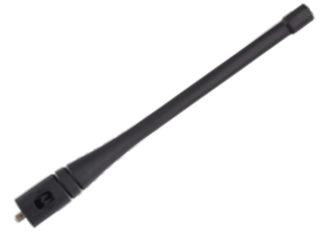
DTR600 Whip Antenna PMAF4024 $30.00