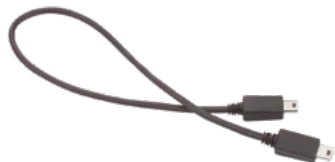
RM Cloning Cable HKKN4028 $20.00