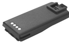
RDX Standard Capacity Lithium Ion Battery RLN6351 $80.00