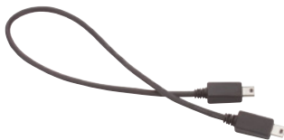
RDX Cloning Cable RLN6303 $20.00