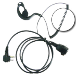
Ear Loop w/Inline Push To Talk P4500M $30.00