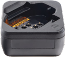
DTR Single Unit Charger Kit PMPN4468 $44.00