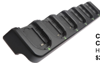
CLP Multi-Unit Charger HKPN4007 $225.00