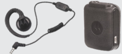
Bluetooth Swivel Earpiece with inline mic HKLN4513 (HKLN4512 sold separately) $24.00