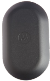
CLP Magnetic Carry Case HKLN4433 $21.50