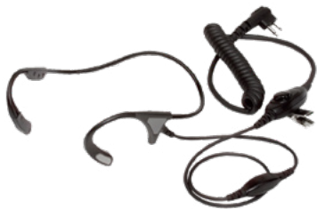
Lightweight Temple Transducer w/Inline Push To Talk RMN5114 $79.00