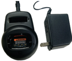
CLS Drop-In Charger Kit 56553 $65.00