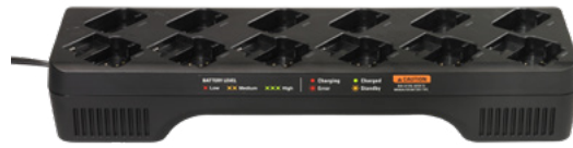
DLR 12 Pocket Multi-Unit Charger PMLN7136 $410.00