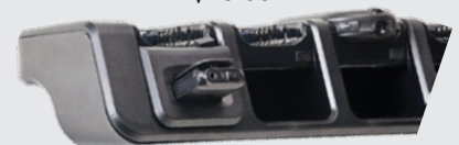
CLP Multi-unit Pod Charger conversion kit HKLN4508 $50.00