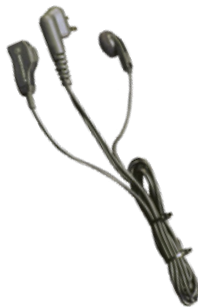
Earbud w/Lapel Mic w/Inline Push To Talk 53866 $61.00