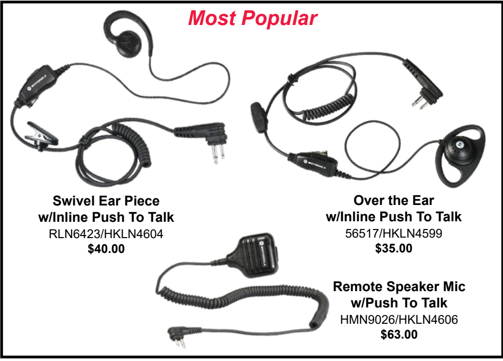
Swivel Ear Piece w/Inline Push To Talk RLN6423/HKLN4604 $40.00