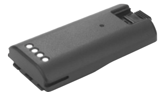
RDX Ultra High Capacity Lithium Ion Battery RLN6308 $110.00