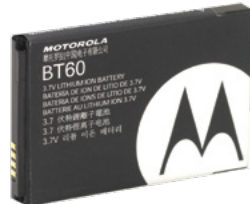
CLP Standard Li Ion Battery HKNN4014 $35.00