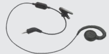
Short Cord Earpiece HKLN4437 $35.00