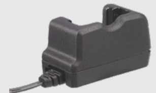
Single Unit Bluetooth Pod Charger HKLN4509 $15.00