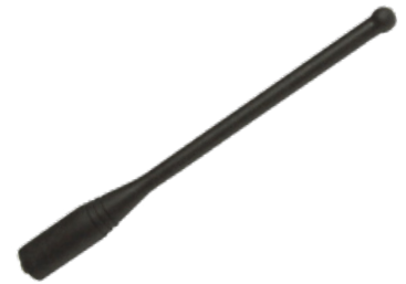
RDU4100/RDU4160d UHF Replacement Antenna RAN4031 $20.00