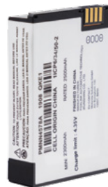
DTR Standard Capacity Lithium Ion Battery PMNN4578 $66.00