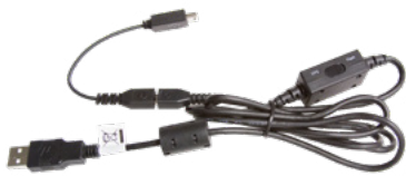
CLP, DLR, RM & RDX, DTR Programming Cable HKKN4027 $40.00