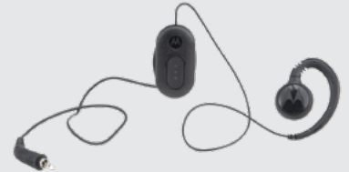
Swivel Earpiece w/Inline Push To Talk HKLN4455 $35.00