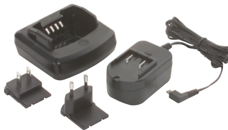
RDX 2Hr. Rapid Charger Kit RLN6304 $65.00