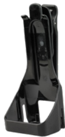
RM Swivel Holster with Belt Clip HKLN4510 $30.00