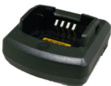
RDX Charging Tray Only RLN6175 $28.00