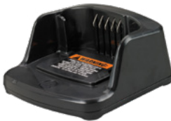
RM Single Unit Charger Kit PMLN6394 $35.00