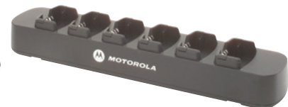
RDX Multi-Unit Charger RLN6309 $275.00