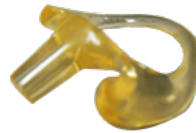
Ear Inserts S9500 $11.00