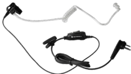
Surveillance Style In the Ear w/Inline Push To Talk HKLN4477/HKLN4601 $70.00