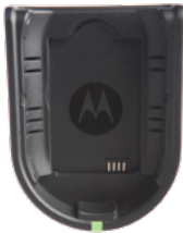
CLP Single Unit Charger Kit HKPN4008 $60.00