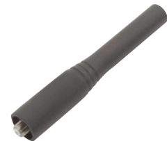
RDU4100 and RDU4160d Stubby UHF Antenna RAN4033 $20.00