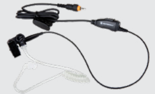
Surveillance Style In the Ear w/Inline Push To Talk HKLN4487 $70.00