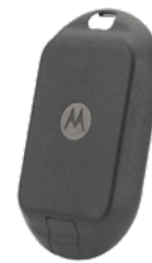
CLP High Capacity Li Ion Battery Door Kit HKLN4440 $10.00