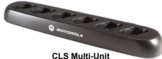
CLS Multi-Unit Charger 56531 $200.00