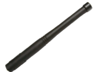
RDV5100 VHF Replacement Antenna RAN4041 $20.00