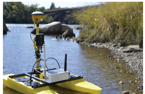
Unit can be integrated into remote / autonomous survey vessels