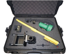
Rugged Shipping Case