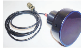
Dual Frequency Echosounder Units