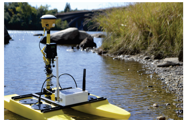
Unit can be integrated into remote / autonomous survey vessels